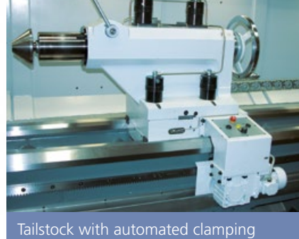
Tailstock with automated clamping and dedicated drive