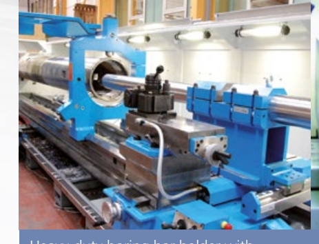
Heavy-duty boring bar holder with additional support and 160 mm bore